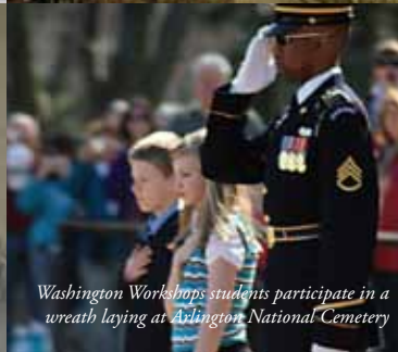
Washington Workshops students participate in a wreath laying at Arlington National Cemetery

"I SAT IN YOUR SEAT 37 YEARS AGO AS A STUDENT - THAT ONE WEEK WITH WASHINGTON WORKSHOPS CHANGED MY MIND ABOUT WHAT I COULD DO IN MY LIFE COMPLETELY." - UNITED STATES REPRESENTATIVE TOM PRICE, R-GEORGIA