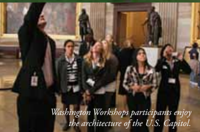
Washington Workshops participants enjoy the architecture of the U.S. Capitol.