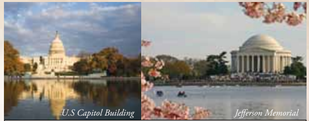
U.S. Capitol Building

Please visit www.workshops.org or call us at 1-88-368-5688 for more information about these programs for your student or child.