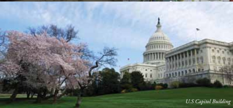
U.S Capitol Building