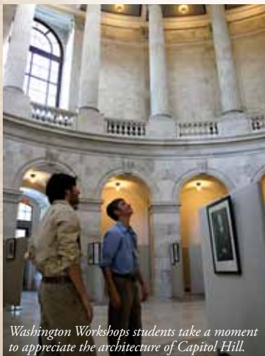
Washington Workshops students take a moment to appreciate the architecture of Capitol Hill.

9:00AM OPTION VISITS TO SMITHSONIAN MUSEUMS OR OTHER CUSTOMIZED TOURS AND VISITS AS SCHEDULES PERMIT 9-NOON DEPARTURE AND HOTEL CHECKOUT