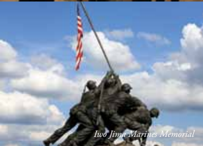
Iwo Jima Marines Memorial