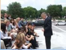
Senator Harry Reid (D-NV), Senate Majority Leader, addresses Congressional Seminar Students on the steps of the U.S. Capitol Building.