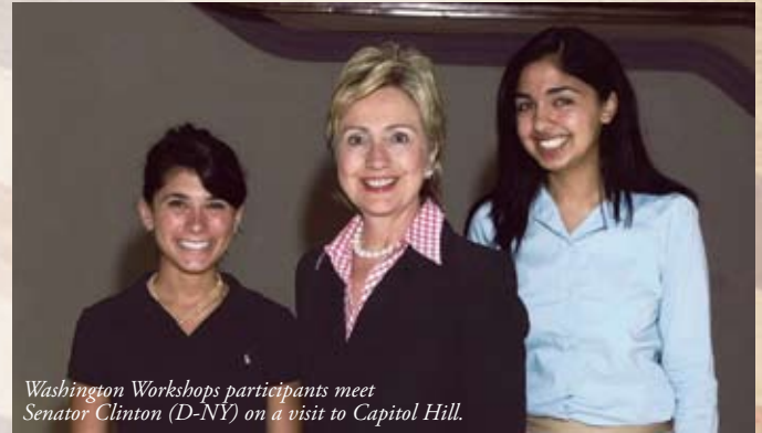
Washington Workshops participants meet Senator Clinton (D-NY) on a visit to Capitol Hill.