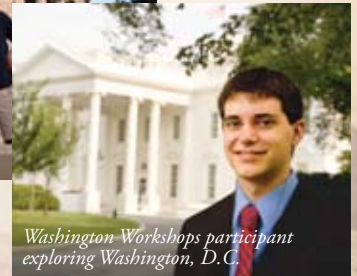
Washington Workshops participant exploring Washington, D.C.

"Washington Workshops students represent the generation of leaders who will help guide our nation in the twenty-first century, and I commend you for your commitment to building a brighter future for all of us." -Former President Bill Clinton