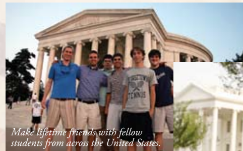
Make lifetime friends with fellow students from across the United States.