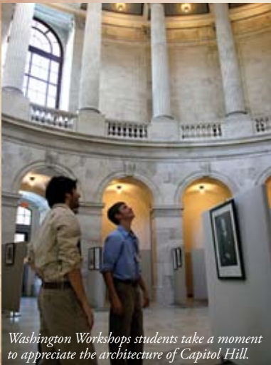
Washington Workshops students take a moment to appreciate the architecture of Capitol Hill.

The Washington Workshops Foundation is a private, nonprofit, nonpartisan education foundation, founded in 1967, which annually presents experiential education and career exploration seminars in Washington, D.C. for high school and junior high school students from across the nation and around the world.